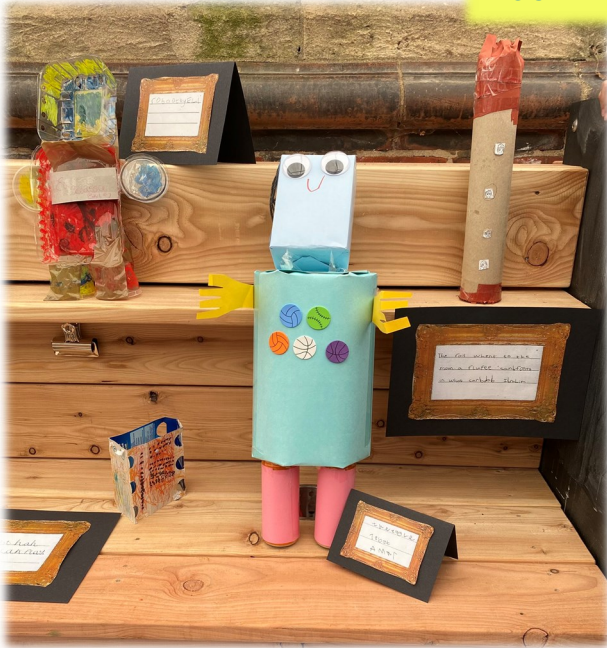
Year 1 toy museum