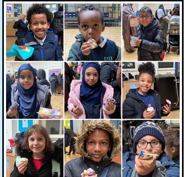
Some very happy children enjoying tasty cakes!

I am very proud of the Year 6 children for organising a bake sale on Thursday to raise money for the crisis in Ukraine. Thank you so much to all of those who brought in baked goods and to those who bought some. You helped raise over £200, which will be doubled by the government, to help provide support to people in Ukraine. A huge thank you and well done to all involved.