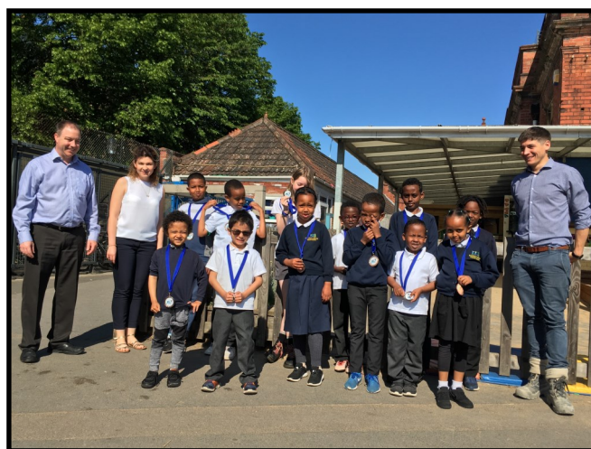
Keir Construction staff and Learning Champions!