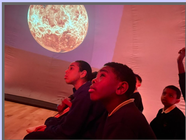
Year 5 with the Explorer Dome!