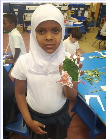
Year 1 making Owl Toparies